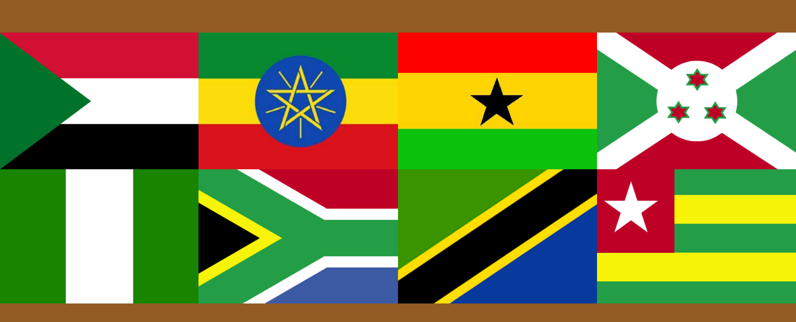
icd - institute for cultural diplomacy